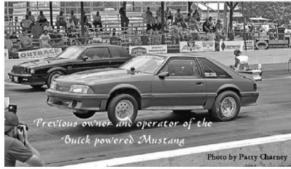
Previous owner and operator of the Buick powered Mustang

Turbos - Injectors - Upgrades Downpipes and Custom Downpipes FAST and BIG STUFF Tuning Motors