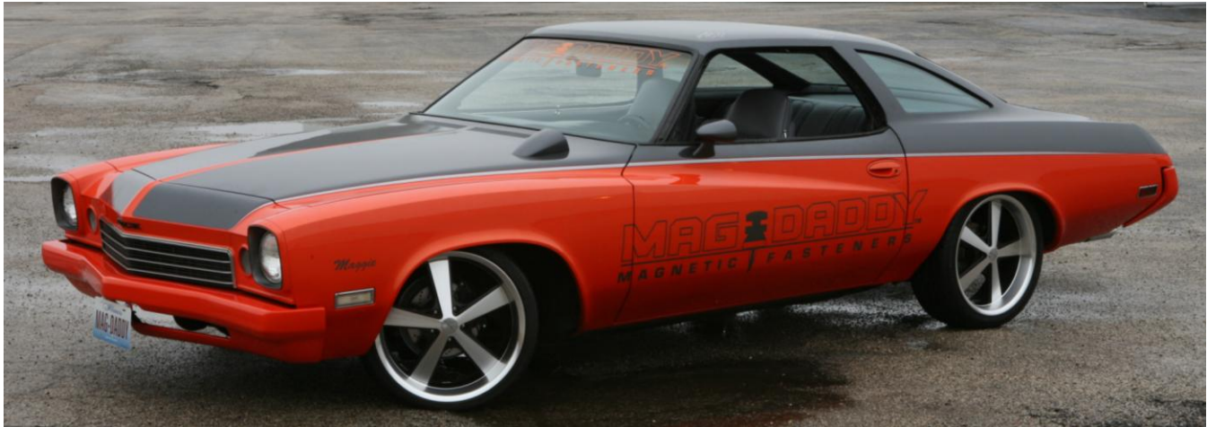
Meet Maggie from HP TV

Volume: 17 Issue: 2 Summer 2011 Chapter of the Gran Sport Club of America ; 625 Pine Point Circle; Valdosta, GA 31602 912-244-0577