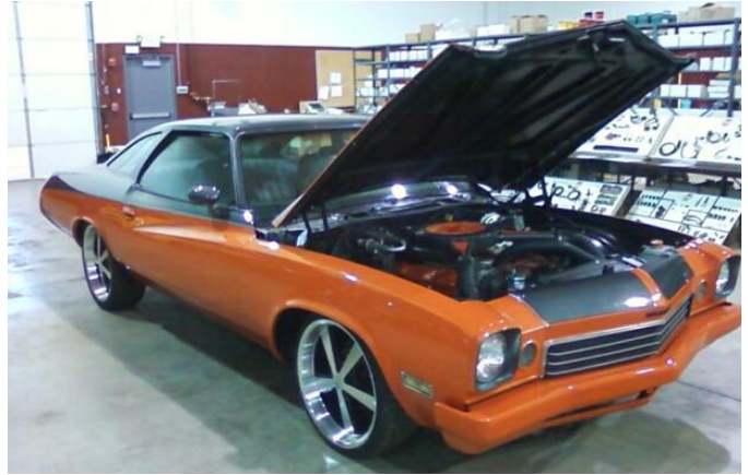
Thanks Beth for this great article about your favorite car.

Please, take a look at your mailing label it has your renewal date