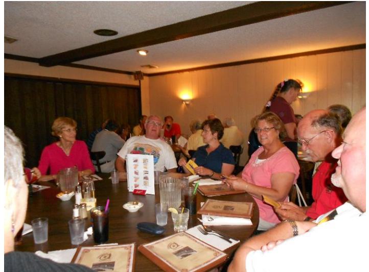
The CCBCA members at the Chapparral table