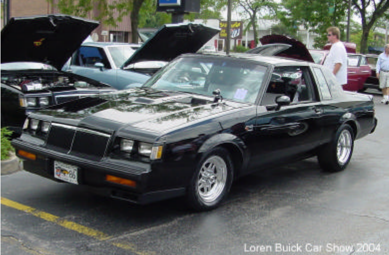
Loren Buick Car Show 2004

Volume 10 Issue 3 Fall 2004 Chapter of the Gran Sport Club of America; 625 Pine Point Circle; Valdosta, GA 31602 912-244-0577