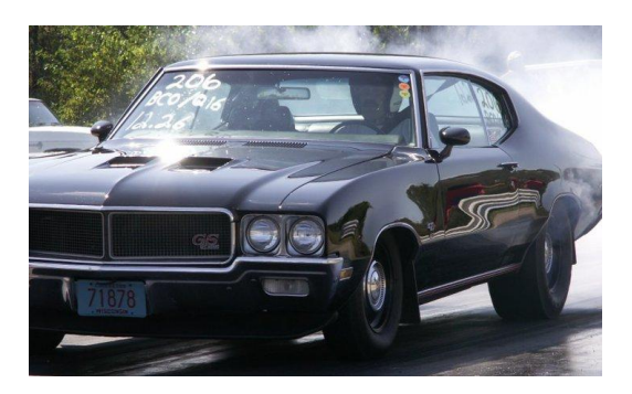
Midwest Buick Challenge Shots