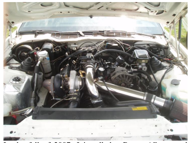
In the fall of 2007, I installed a Razor Alkycontrol alcohol injection system and a 3" Terry Houston

In spring 2005, I got a GT3255 turbo, Dutt neck intercooler, and 50lb injectors. I then ordered a 100 octane chip from Turbo Tweak and had Dennis Butt make me a test pipe with a dump. My goal with this car was to have a 12.00 street car. So these parts would easily make that goal achievable. In spring of 2005 we went to a Test and Tune at Rt 66. I ended up running a best of 12.80s that day. Not bad for a first time out with a car that was never run before. We went to Byron next for the Samantha Rix race. I ended up getting the car down to 12.20s that day, which I was somewhat happy with. Based on my experience with the Grand National, I knew it would go faster. But after that trip to the track, I noticed the stock transmission was kind of sloppy. So I decided to take it to Jimmy for a new transmission and a 10" Neal Chance converter. The transmission and converter turned out great. The GT3255 spooled great with the stock converter and now the boost was instant with the new converter. I also decided to run 110 octane the next time out and see what it could do. That fall, at Byron I got the car down to 11.83. The car would run 11.90s.-12.00s at 110+ consistently with that set up and low 20lbs of boost. Overall I was happy with how the car ran.