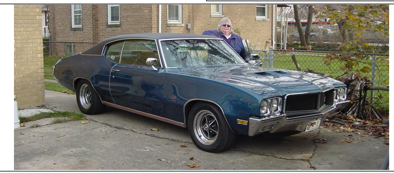
Thanks to all who offered condolences, went to the wake or memorial service.

Her "membership scribbling" were often completed long before we had the cover car information and I got around to writing my little bit. Often I would consult her section first in order to just not repeat what she had already said, therefore keeping mine short. I just got through reading her last entry and discovered it is like reading minutes for most every meeting we had. Will truly miss this insight. She truly ran the CCGSCA.