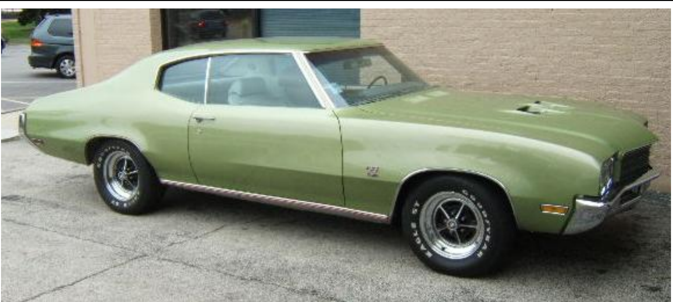
Ed Wolters 1971 GS 455

Summer 2013 Chapter of the Gran Sport Club of America ; 625 Pine Point Circle; Valdosta, GA 31602